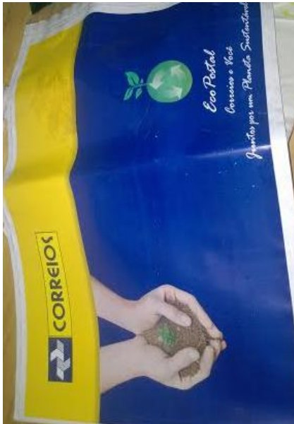
Illustration 1. Sample before the study began