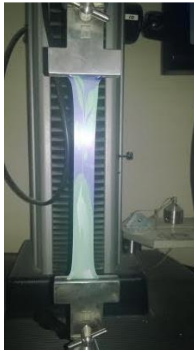
Illustration 2. Sample in the universal machine "elongation test".