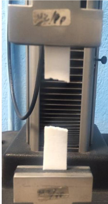
Illustration 3. Sample A.17 after 31 hours.