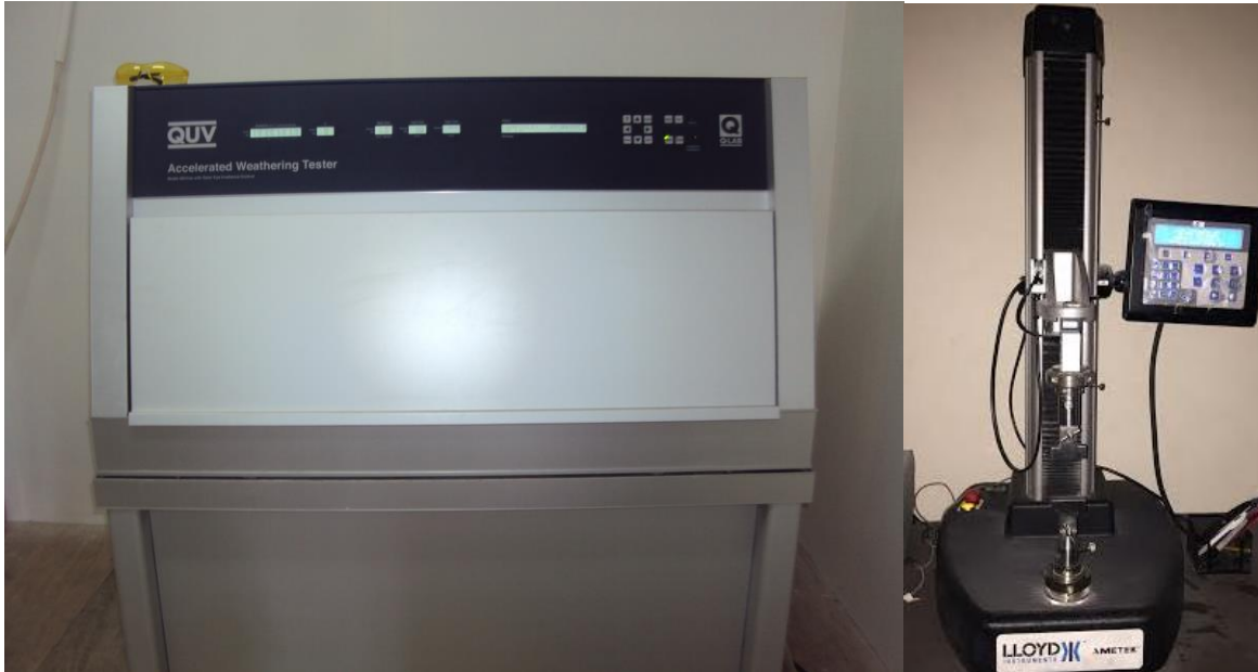
Illustration 1. Laboratory equipment