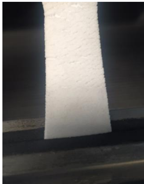
Illustration 4. Sample A.17 after 456 hours.