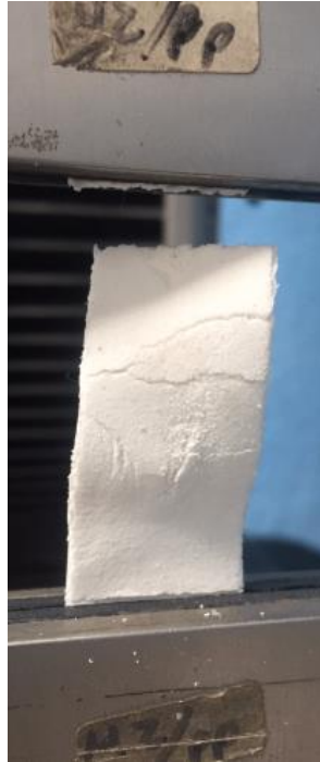
Illustration 5. Sample A.17 after 501 hours.