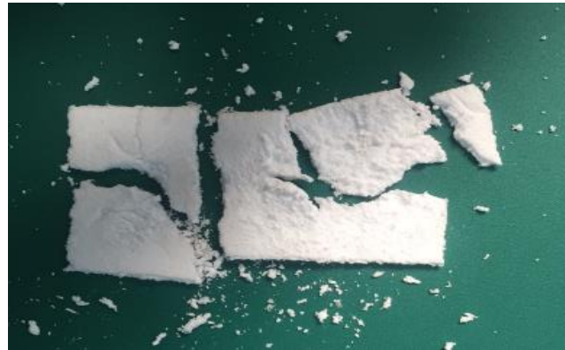
Illustration 6. Sample A.17 after 582 hours.