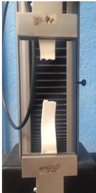
Illustration 2. Sample A.17 first evaluation.