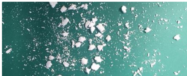
Illustration 7. Sample A.17 after 704 hours.