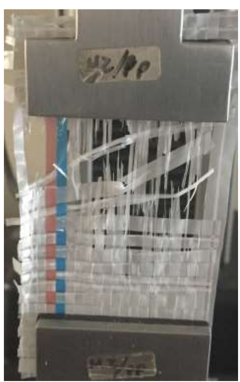
Illustration 4. Sample M1 after 13 days of study