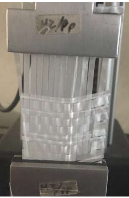
Illustration 3. Sample M1 after 7 days of study.

\begin{array}{l} P\text{-Life America Latina}\\ P\text{-Life}^{\text{TM}} & Biodegradable \ Plastic \ Technology \end{array}