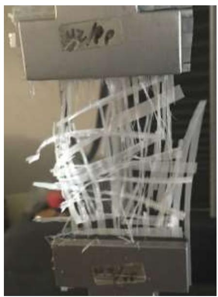
Illustration 5. Sample M1 after 15 days of study

P-Life America Latina P-Life<sup>TM</sup> Biodegradable Plastic Technology