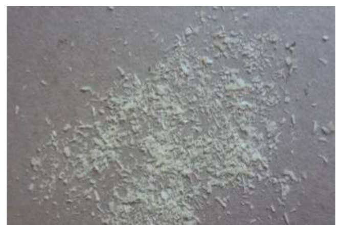
Illustration 7. Sample M1 after 20 days of study