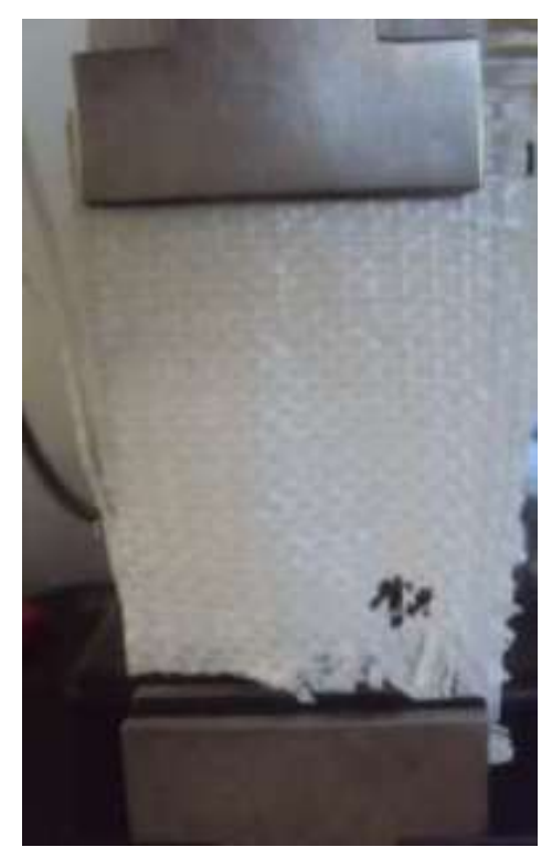
Illustration 2. Sample M1 in the universal machine before the study began.