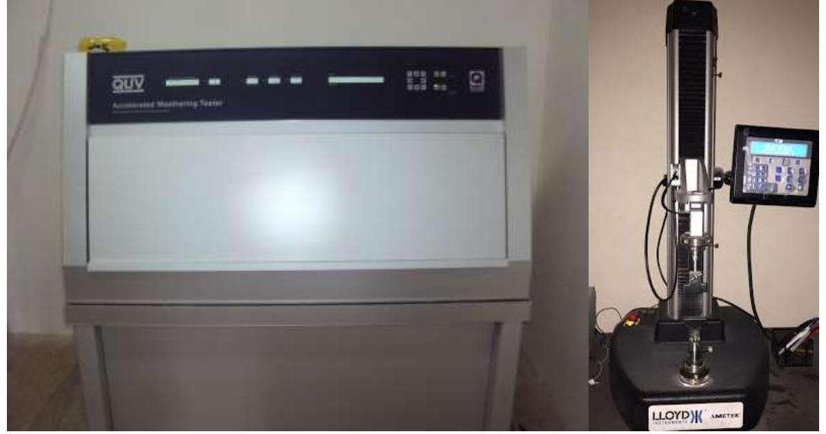
Illustration 1. Laboratory equipment