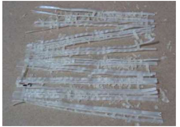
Illustration 6. Sample M1 after 17 days of study